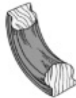
90° UP EASING 8214