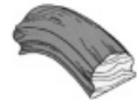
OVERHAND EASING 8213