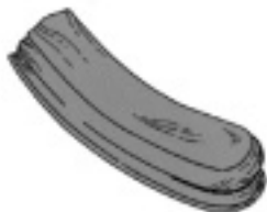
STARTING EASING 8215