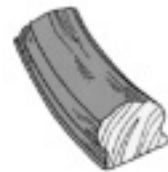
UP EASING 8212