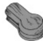
OPENING CAP 8219