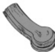
STARTING EASING W/CAP 8210