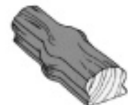
TANDEM CAP 8220