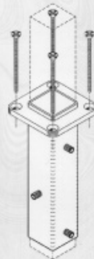
*New Size Option: * 1/4" Finish Options: VI, VII, VIII S-MXL798