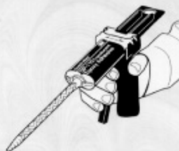
S-GUN Epoxy Applicator