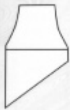
S-SHOE-R Baluster Rake Shoe Finish IV