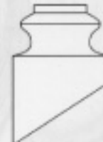
S-M792 Baluster Rake Shoe Round Center Finish Options: II, III