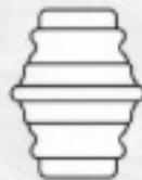
S-M795 Knuckle Round Center Finish Options: II, III