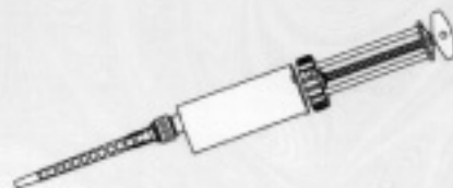
S-EPOXYKIT EPCON A7 All-in-One Epoxy Adhesive Kit S-NOZZLE-2 Epoxy Applicator Nozzle