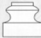
S-06 Baluster Flat Shoe Finish Options: I, II, III V, VI, VII, VIII