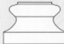
S-06N Newel Flat Shoe Finish Options: I, II, III V, VI, VII, VIII