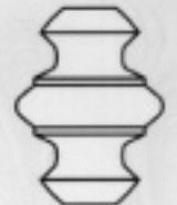
S-M798 Knuckle Square Center Finish Options: II, III, V VI, VII, VIII