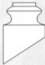
S-02 Baluster Rake Shoe Finish Options: I, II, III V, VI, VII, VIII