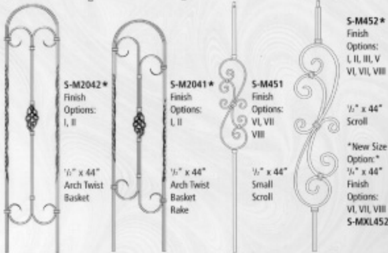
S-M2042* Finish Options: I, II \frac{1}{2} " x 44" Arch Twist Basket