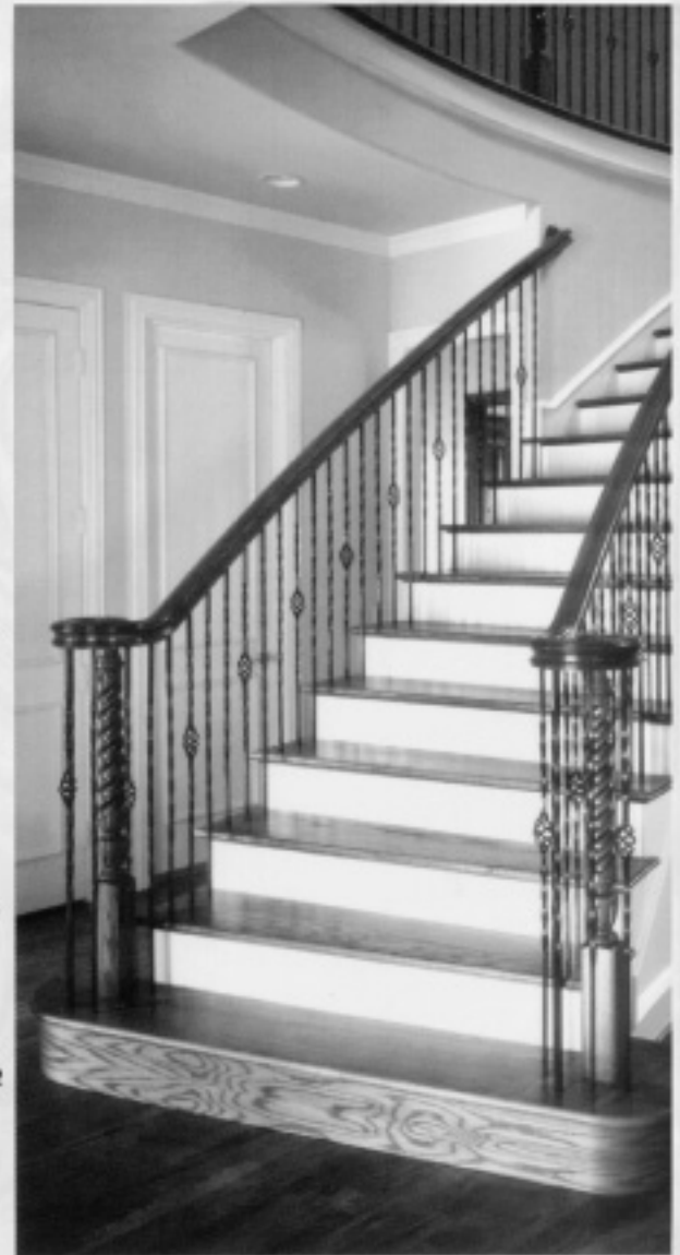
S-M452* Finish Options: I, II, III, V, VI, VII, VIII \frac{1}{2} " x 44" Scroll *New Size Option: \frac{1}{4} " x 44" Finish Options: VI, VII, VIII S-MXL452